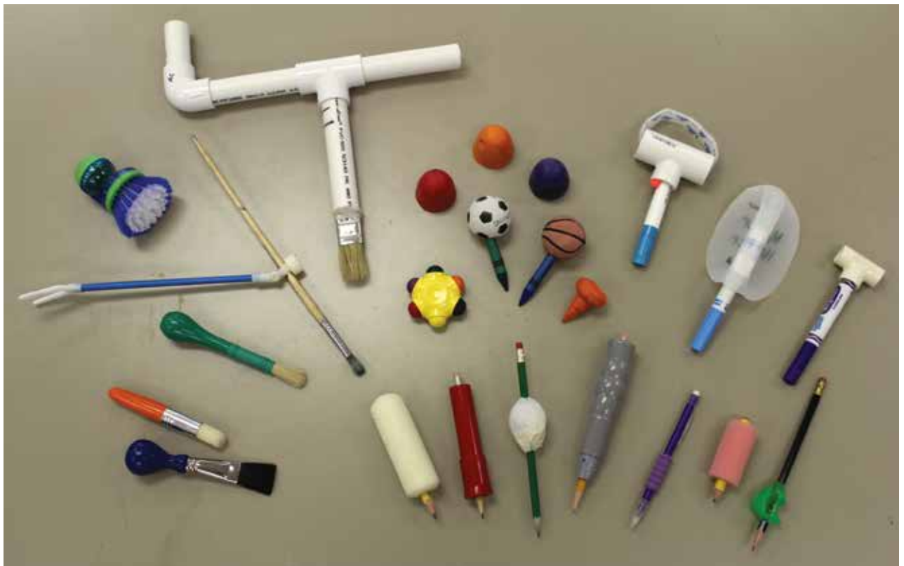
Figure 2. Examples of adapted painting, coloring, and writing implements.

Paintbrush options from top to bottom: interchangeable PVC pipe paintbrush, dish scrubber used for painting, paintbrush secured with a mouthstick, three larger-handled paintbrushes. Crayon solutions at the top middle: homemade egg carton crayons, crayons attached to small rubber balls, commercially available multicolor crayon holder (yellow, center), commercially available finger crayon (orange). Marker solutions on the top right: PVC and Velcro strap marker holder, marker holder made from a gallon jug and Velcro, PVC marker holder. Pencil or thin paintbrush solutions at the bottom, from left to right: trim paintbrush roller cover (white, center), BIP Grip (red, commercially available enlarged surface for pencils), Styrofoam egg, commercially available weighted pencil holder, commercially available pencil grip, pencil grip made from a curler sponge, commercially available pencil grip.