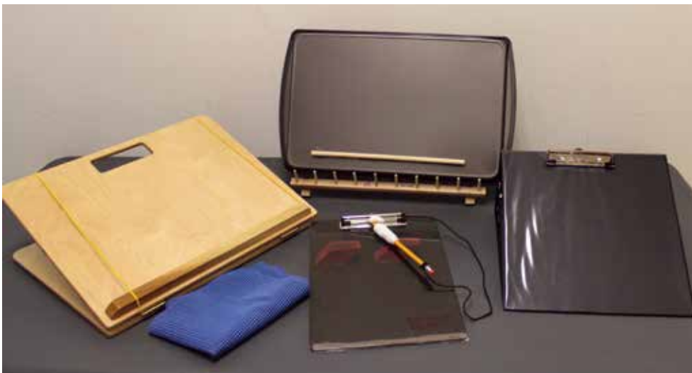
Figure 1. Examples of surface adaptations. Left to right: commercially available adjustable slantboard, rubber shelf liner to secure slantboards or other materials on a table, slantboard made from a clipboard propped on stacks of erasers (middle front), slantboard made with a spool holder and baking sheet so magnetic items will stick to it (middle back), slantboard made from stacked binders with a clipboard clip attached.

Adaptive art tools should be standard equipment in the art room for all students to use, not just for the students with disabilities. As long as the tool is available when the specific students need it, it should not be kept in isolation from peers. It is important to remember that an adaptive art tool only becomes assistive technology when the student requires that particular tool to access his art making. Successful integration of adaptive tools into the art classroom for use by students with special needs is increased when the adaptive tools are available to all. Many art tools were not especially designed to be adaptive, but due to their features, are quite adaptive. (p. 50)