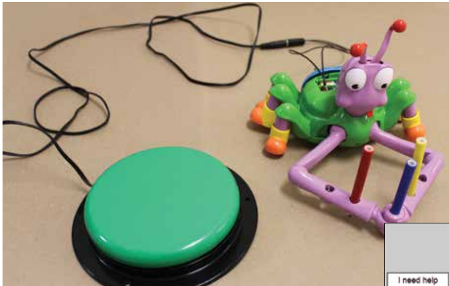
Figure 3 (left. Doodle Doug, battery-operated scribbler, adapted to make accessible with a switch. A battery interrupter has been added to interrupt the flow of electricity. The large green switch is plugged into the battery interrupter; a student with very limited movement can color with markers independently by pressing the switch to make Doodle Doug operate.

device similar to a Light Bright, which contains a light bulb underneath a frosted—but see-through—plastic surface. Backlighting can also be accomplished by having a student with low vision view images on the computer. Rarely will you work with a student who has no vision, so color or lighting solutions may be sufficient. It is important for art teachers to remember that students with very limited vision have difficulty with concept development; more abstract concepts, such as expression of feelings in a piece of art, may need instruction through other means (e.g., tactilely different materials, listening to a drama with expressions of emotions) (Shih & Chao, 2010). Using tactile materials may supplement or supplant visual perception and create meaningful connections for students with severe vision losses (Heller, 2000; Heller, Brackett, & Scroggs, 2002). Along these lines, students with more severe vision loss might use tactile materials instead of painting or drawing tools. For example, a student creating a beach scene might use sandpaper, cotton balls, and puff paint to create his or her beach image. In this case, however, the student would have to have received prior instruction on the symbolism of each of these textures (e.g., exploring the feeling of sand).