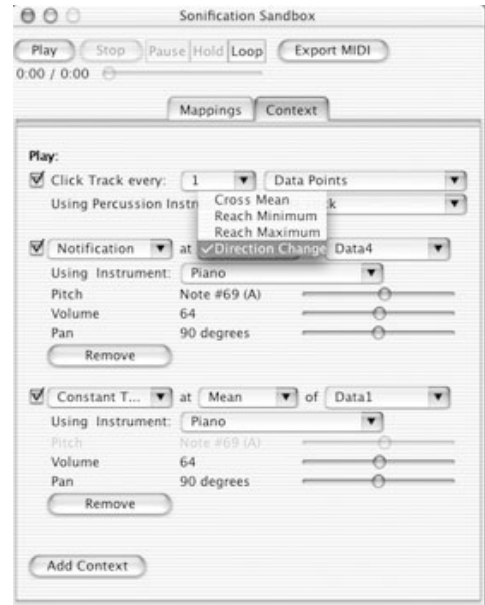
Figure 2: The Context Panel for the Sonification Sandbox