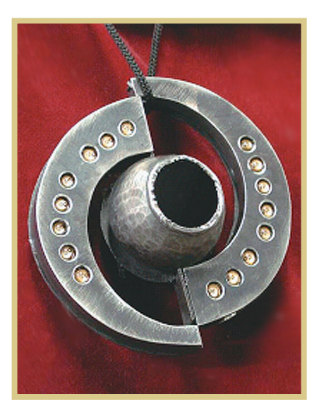
Figure 2. The Gesture Pendant. This wearable computer recognizes a simple set of hand gestures using infrared illumination and a CCD (charge-coupled device) camera.

tremors in the hand, possibly serving as an early indicator of neurological impairments such as Parkinson's disease.<sup>6</sup>