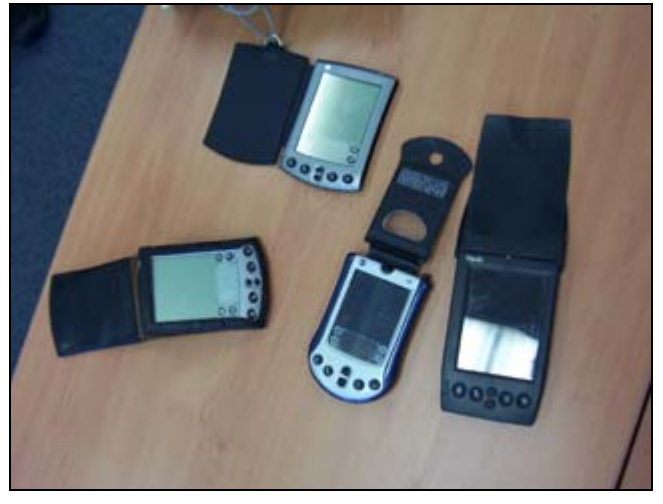
Figure 4. A few of the Personal Digital Assistants used by the amnestics on the design team.

Before the formation of our design group, a researcher (the second author) had trained the amnestics in our team to use a Palm Pilot PDA for scheduling appointments and managing lists of action items as part of a rehabilitation program independent of our design project. This training made use of procedural memory systems that remain intact in amnestics [21] (see Figure 4). As such, each member of our design group used a Palm device on a daily basis. We wanted to utilize this training by synchronizing meeting notes into the Palm. In this way, members could take home the minutes and would have access to them throughout the week. Since the memo application was frequently used, the likelihood of reviewing the material from our meetings was reasonably good.