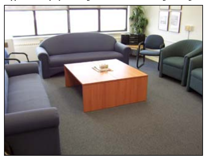
Figure 1. The Baycrest meeting room used for psychoeducational support group meetings.

Some research has specifically used a person's environment to reduce the demands on memory [4, 12, 23]. A simple illustration is the use of name tags that allow people to refer to one another by name. The tags remain with their wearers and constitute a part of the environment. We have utilized this theme of environmental support to architect a space for design sessions intended to support memory by reducing the demands on it during meetings.