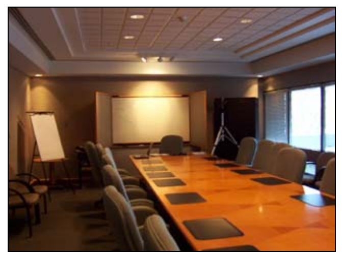
Figure 2. The Baycrest Exton board room used for design group discussions.

The board room is a very distinctive space. It conveys a special feeling of importance as many people associate board rooms with prominent executive meetings. While Baycrest is a familiar location, none of the design group members have worked in the board room before.